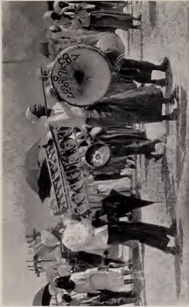
The musicians in a Buddhist funeral procession at Mandalay. The body is beneath the canopy at the rear